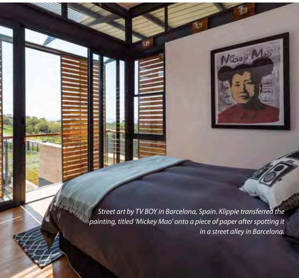
Street art by TV BOY in Barcelona, Spain. Klippie transferred the painting, titled 'Mickey Mao' onto a piece of paper after spotting it in a street alley in Barcelona.

"The main idea for the design of the house was to show my clients that going green is a viable and responsible choice," says Klippie. "Concrete is my favourite material, not only for its long life cycle but also for its character. I like to show materials for what they are, instead of hiding them. So with Green Verandah I've tried to stick to the honesty of the materials and show what I've used."